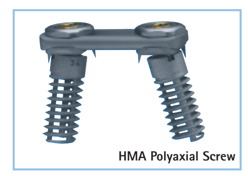
The HMA Screw provides unsurpassed pullout strength for compromised or insufficient bone quality.