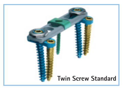
The Twin Screw delivers four point fixation for resistance to bending, torsional and axial loading for optimal stability and plate position flexibility.