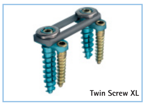
The XL Screw provides revision capability with greater purchase for increased pull out strength while maintaining the four point fixation philosophy.