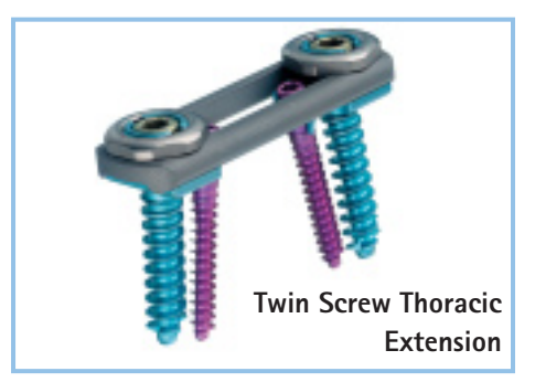
The Thoracic Extension option accommodates the limited anterior posterior dimension of the upper thoracic region, while providing four point stability by positioning the screws vertically for maximized purchase.